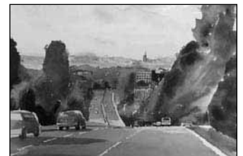
Views along 280 with and without the elevated. Watercolors by Bob Moody.